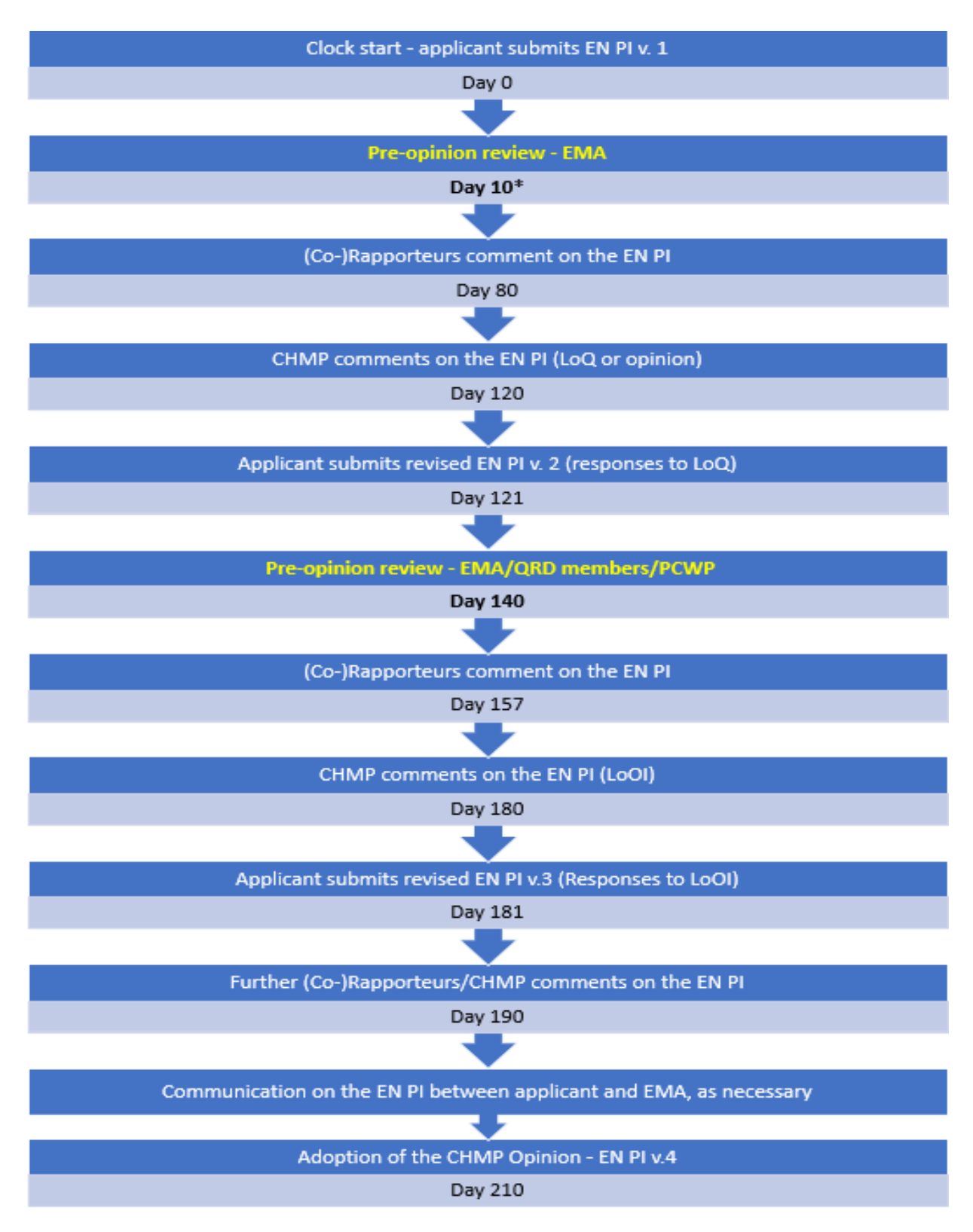
Annex I: Pre-opinion review timelines (EN PI only) for Initial Applications and Line Extensions