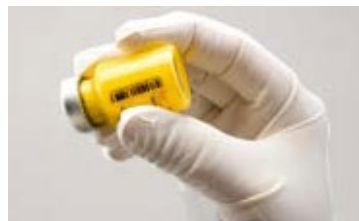
Figure C: Vigorously shake vial

If foam forms, let vial stand to allow foam to dissipate. If the product is not used immediately, it should be shaken vigorously to re-suspend. Reconstituted ZYPADHERA remains stable for up to 24 hours in the vial.