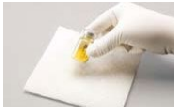
Figure A: Tap firmly to mix