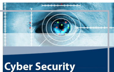
Cyber Security Cyber Security