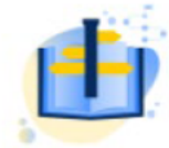
Clinical trial methodologies