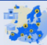
Multinational clinical trials by non-commercial sponsors