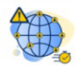
Clinical trials in public health emergencies