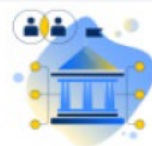
Mapping & governance