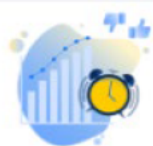
Implementation of the Clinical Trials Regulation