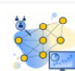
Clinical trials analytics