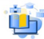
Clinical trials training curriculum