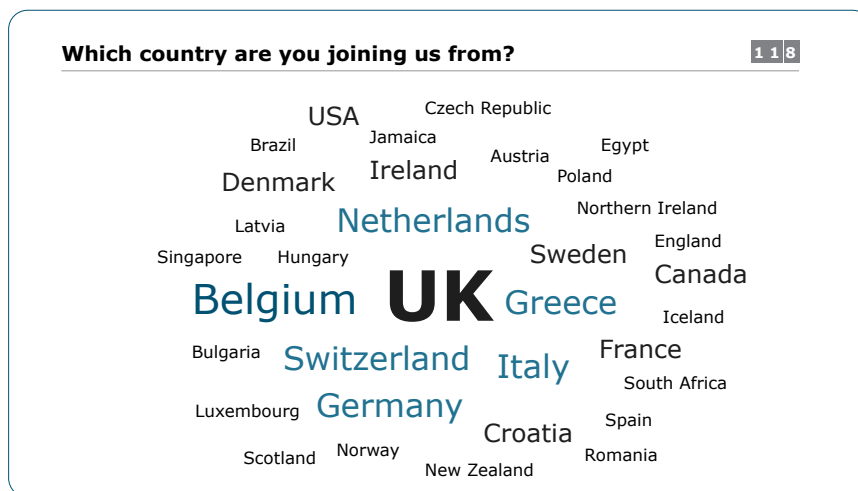
Feedback collected in real time from workshop attendants using an audience polling tool (Slido).