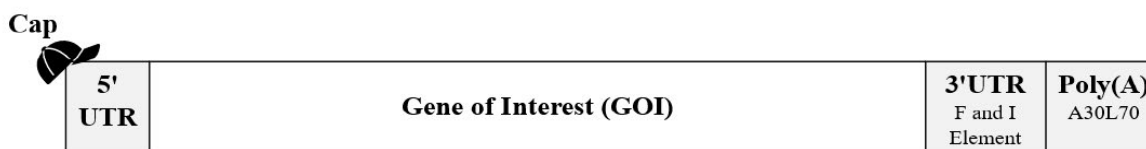
Figure 2.3.S.1-1. General structure of the Omicron KP.2 mRNA

Schematic illustration of the general structure of the BNT162b2 Omicron KP.2 mRNA drug substance with 5'-cap, 5'- and 3'-Untranslated regions (5'-UTR and 3'-UTR, respectively), coding sequence for the Gene-of-Interest (GOI), and a poly(A)-tail. GOI is SARS-CoV-2 full-length spike. Individual elements are not drawn to scale compared to their respective sequence lengths.