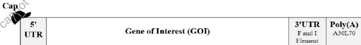
Figure 2.3.S.1-1. General structure of the Omicron LP.8.1 mRNA

Schematic illustration of the general structure of the BNT162b2 Omicron LP.8.1 mRNA drug substance with 5'-cap, 5'- and 3'-Untranslated regions (5'-UTR and 3'-UTR, respectively), coding sequence for the Gene-of-Interest (GOI), and a poly(A)-tail. GOI is SARS-CoV-2 full-length spike. Individual elements are not drawn to scale compared to their respective sequence lengths.