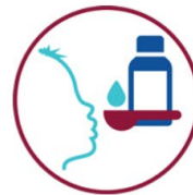
Paediatric Medicines Formulations