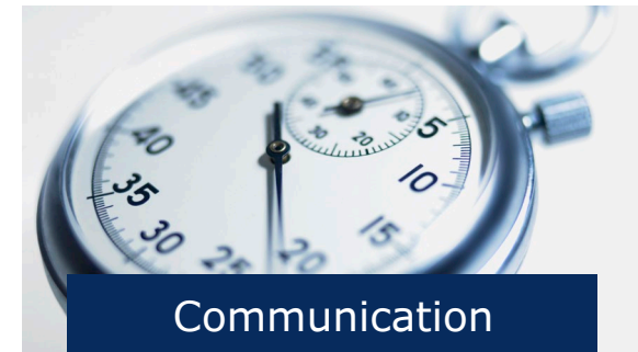
Communication planning and monitoring