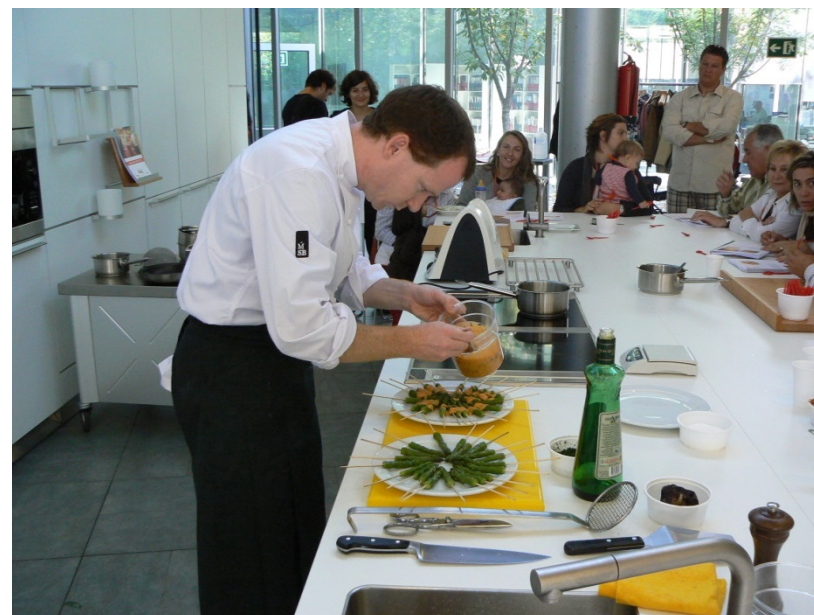
Workshop for teenagers