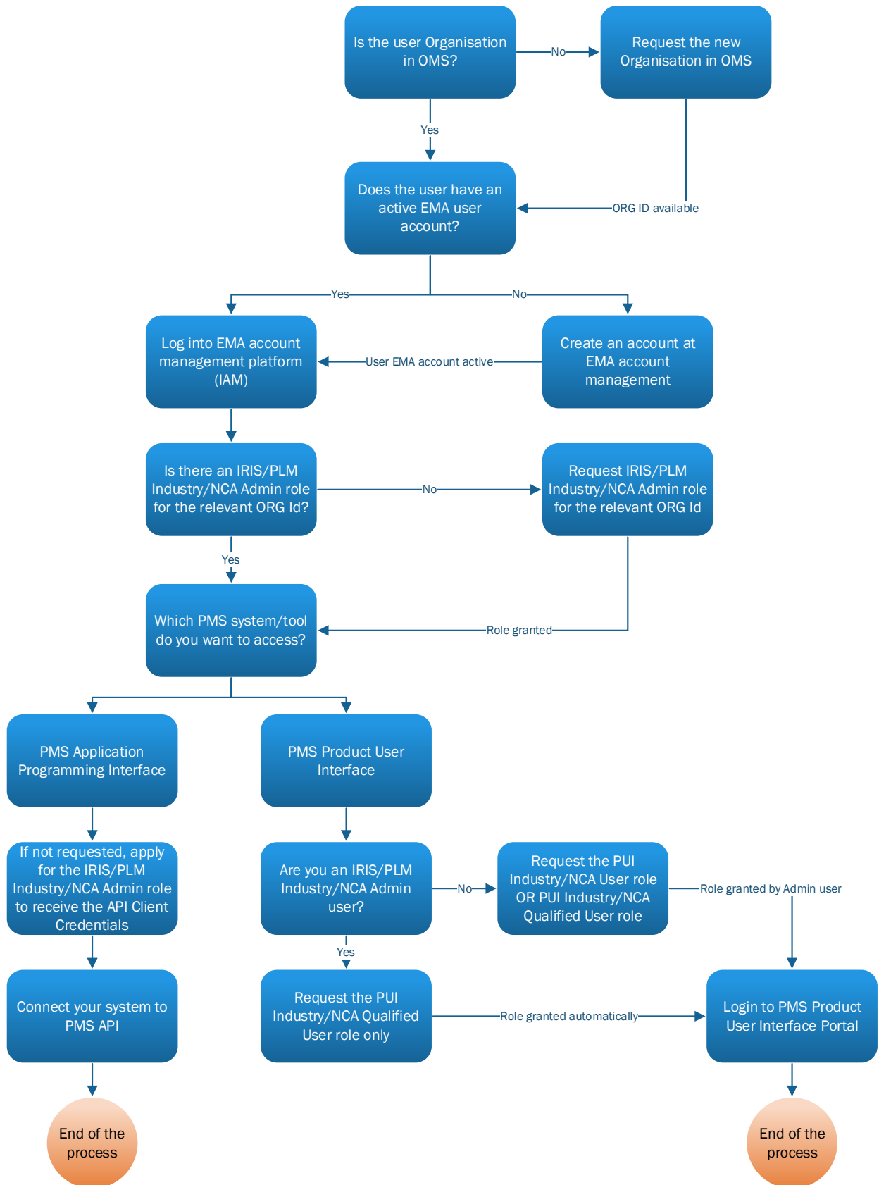
Figure 1: Overview on the PMS registration process